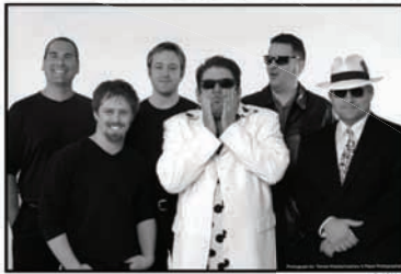
ONE OF THE PERFORMANCES for the Red, White and Kaboom. Dangerous Jim and the Slims

About midway through the Ohio Military Band show, the Lori Lee Band will plug in